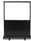
60-inch mobile screen L1633A

Easily connect your HP projector to your DVD and VCR for the ultimate home theater experience.