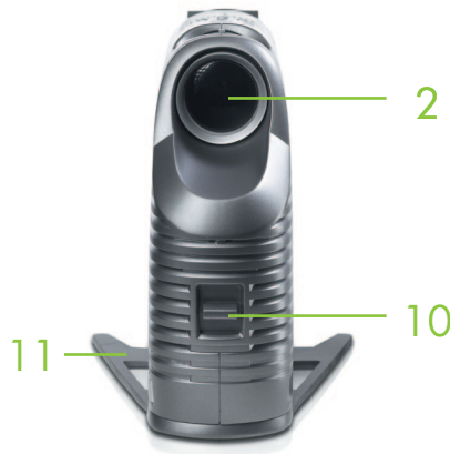
HP Digital Projector mp3130 (front view shown)