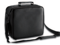
Combination carrying case L1622A

Easily connect to a wide range of video equipment, from a VCR to a camcorder.