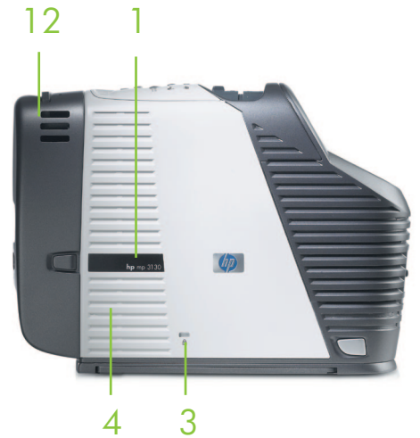
Optional Smart Attachment Module (side view shown)