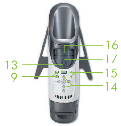
Controls (top view shown)