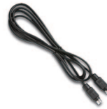
6-foot S-video cable L1635A

Lightweight and easy to carry with a built-in handle, this mobile screen sets up easily anywhere you need it.