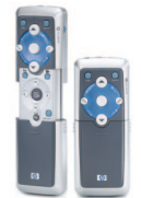
Wireless remote control with USB L1631A

The lightweight and sturdy design allows you to take a notebook, projector, and even a mobile printer, wherever you need to present.